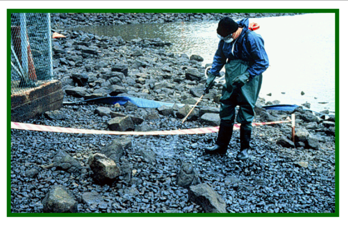
Dispersant Trials, "Iron Baron", Tasmania 1995

SEER Contingency Plans are concise, focussed and usable.