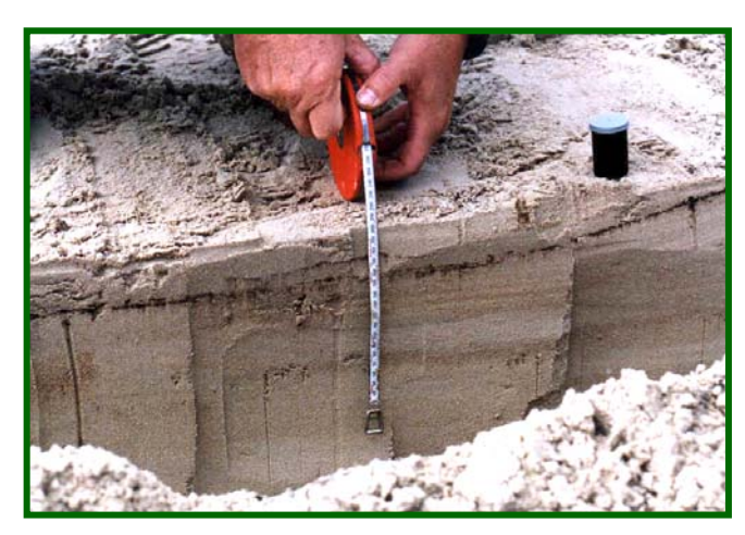
Residual Oil Surveys

These assessments include recommendations for any remedial actions that may be required.